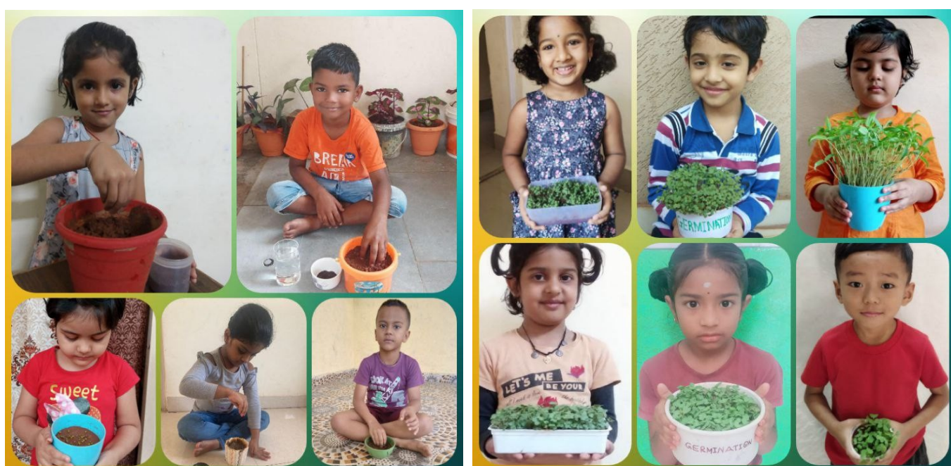
STUDENTS SOWING SEEDS