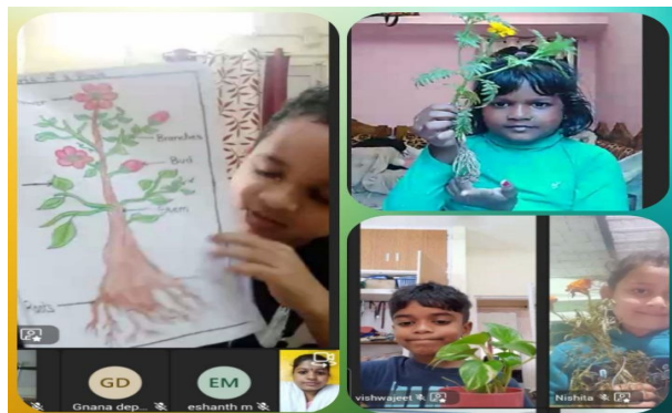
STUDENTS SHOWING PARTS OF PLANTS