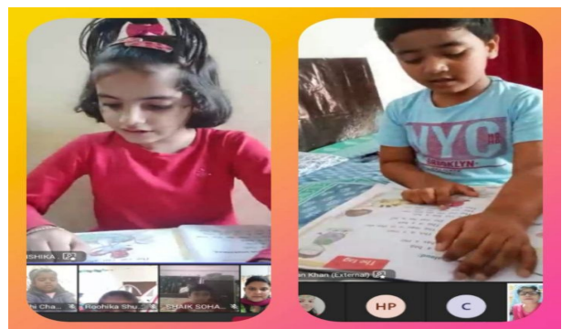
STUDENTS READING FROM PHONO DRILL