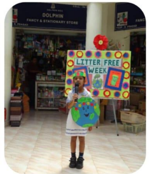
On 21 st September children made a visit to the Shopping Complex to spread the need of Swachh Bharat.