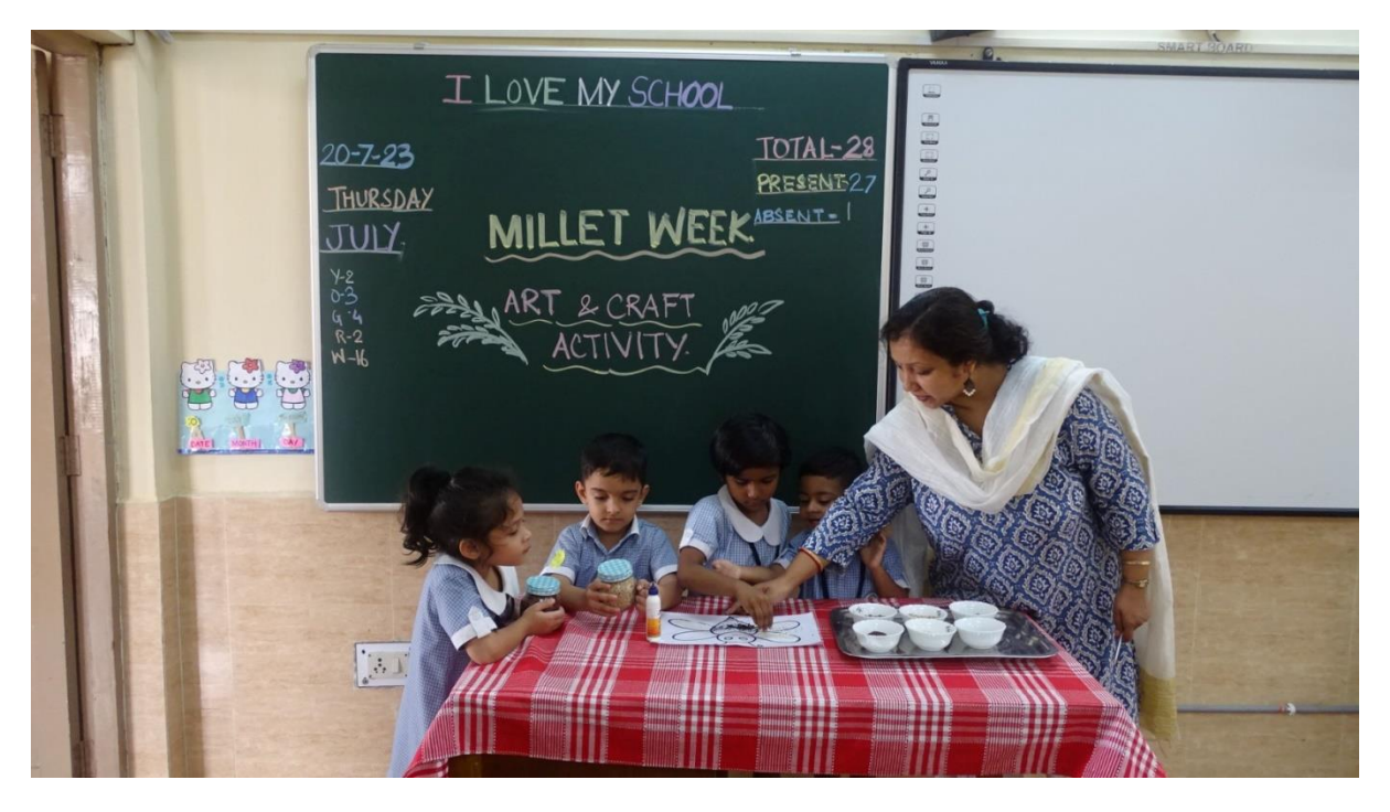
ART AND CRAFT - MILLET PASTING ACTIVITY - LKG

Through the week long celebration, students learnt the names of different types of millets and how they can be included in our diet as a healthier option.