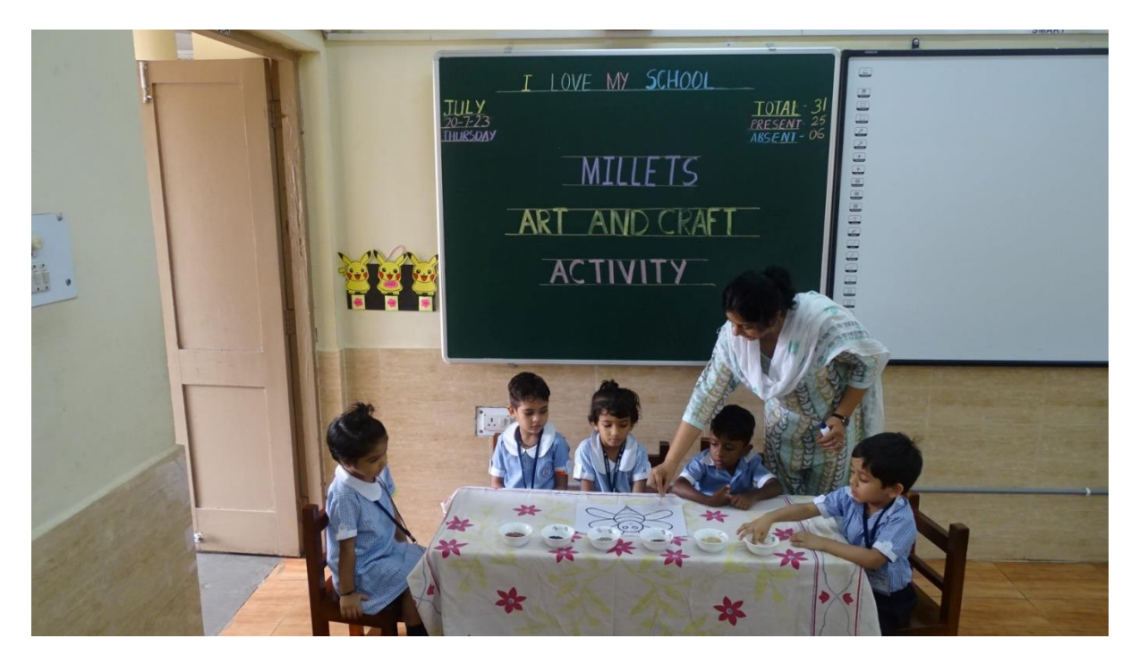
ART AND CRAFT - MILLET PASTING ACTIVITY -LKG